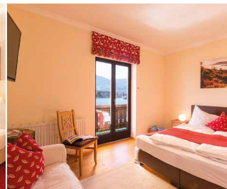
„CLASSIC“ with wooden floor 20qm