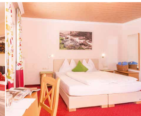
„KOMFORT“ with carpet (wooden floor) 25qm