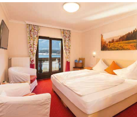
„CLASSIC“ with carpet 20qm